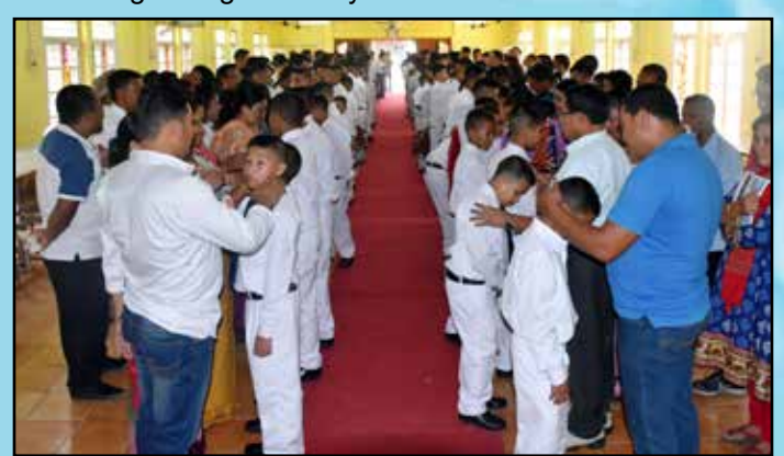
Cadets of Class VI being blessed by their parents on the occasion of 'Blessing Ceremony'

On the occasion, the Principal addressed the cadets and advised them to stay at the school with comfort and happiness. Educating the young cadets about aims and objectives of Sainik Schools, he urged them to maintain discipline and also to work hard with enthusiasm and devotion to accomplish their goal in life. A Bara-Khanna was organised as part of the Ceremony. In conclusion, cadets sought blessings from their parents for their success and well-being during their stay at the school.