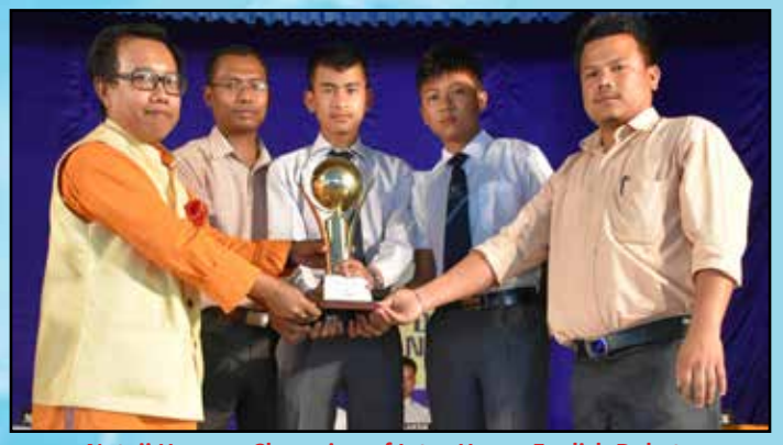
Netaji House – Champion of Inter-House English Debate Competition (Jr)