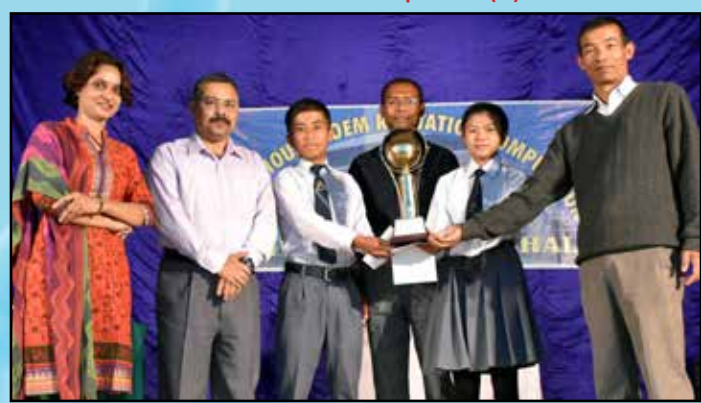
Raman House – Champion of Inter-House Manipuri Poem Recitation Competition (Jr)