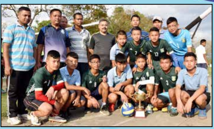
Tagore House – Champion of Inter-House Volleyball Championship (Jr)