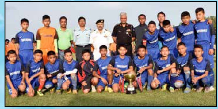
Tagore House – Champion of Inter-House Football Championship (Jr)