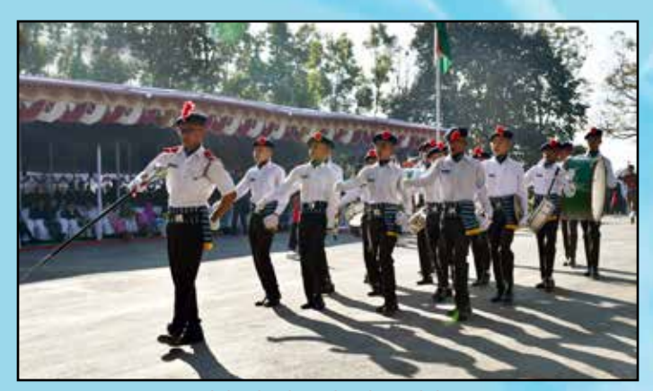
Band display by School Band during the Republic Day Celebrations at Kangla Fort, Imphal