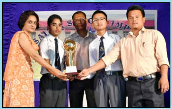
Netaji House – Champion of Inter-House English Debate Competition (Sr)