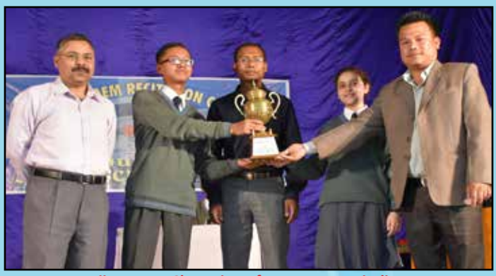
Netaji House – Champion of Inter-House Hindi Poem Recitation Competition (Jr)